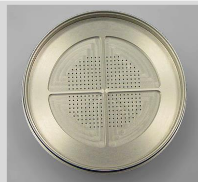
Figure 2. Nozzle pattern for Stage 3

Multiple nozzles at each stage provide flow conditions that result in sharp-cut size characteristics (Figure 3) and low pressure drop.