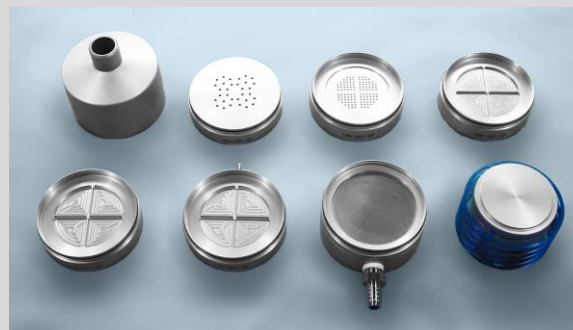
Figure 1. High-Flow impactor parts