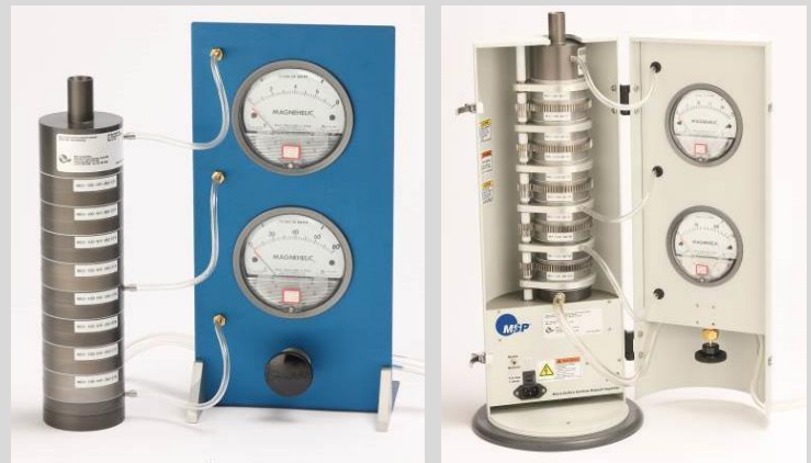
Model 100NR (w/o Rotator)