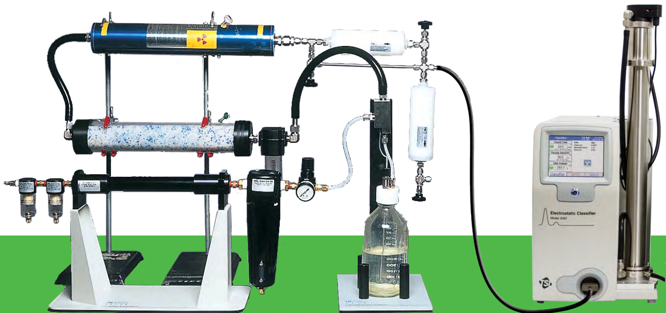
This Model 3940A system is shown ready to calibrate a TSI Model 3082 Electrostatic Classifier. Ask your TSI representative about additional components needed for your particular application.

The standard Model 3940A system uses two neutralizers to ensure that particle charge is fully reduced to a Fuch's equilibrium before aerosol enters the DMA. By itself, the 3077A may not be adequate if the high-concentration aerosol generated by the atomizer is also highly charged.